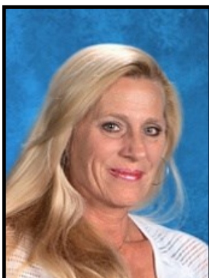
(2016-17 school photo)